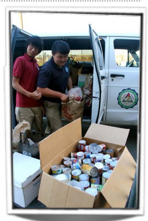
Students donate cans to food bank